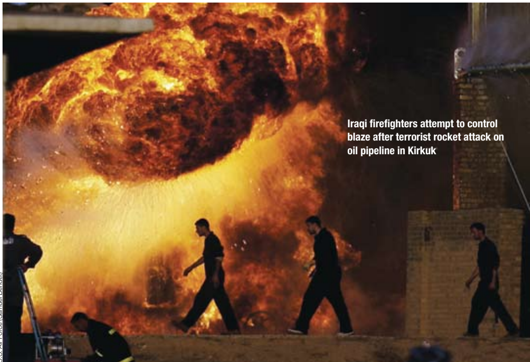
Iraqi firefighters attempt to control blaze after terrorist rocket attack on oil pipeline in Kirkuk

By the end of 2007, the JROC/JPC had successfully spawned similar forums. The Joint Rural Planning Committee (JRPC) expanded the JPC concept into the outlying Qadas (rural districts) of Baghdad Province. The initiative immediately proved successful by applying lessons learned from the JPC, and was central in reaching out to communities that consisted mainly of Sunnis dispersed